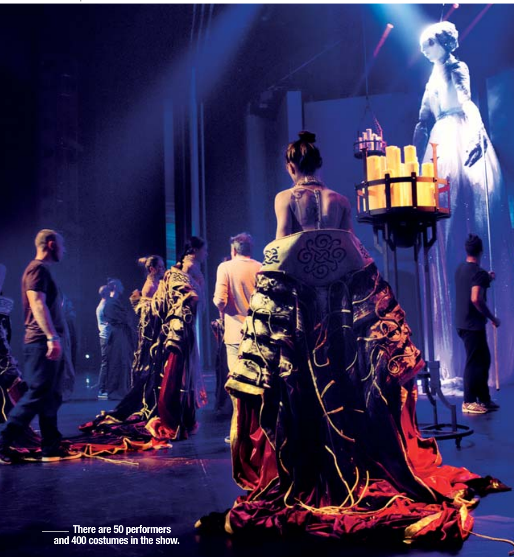
There are 50 performers and 400 costumes in the show.

“Visually, it’s the most beautiful show I’ve ever done”