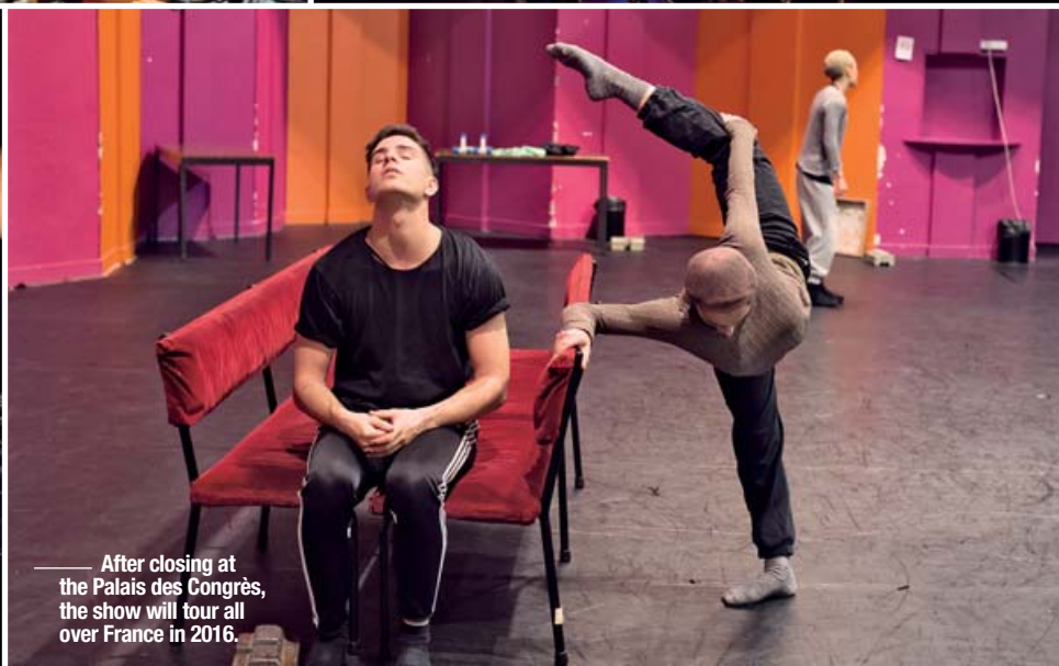
— After closing at the Palais des Congrès, the show will tour all over France in 2016.